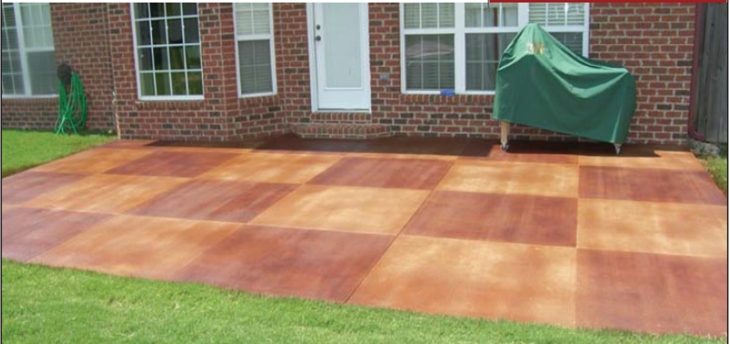
This two-color application of Color Juice Colorant and Color Juice Sealer turns an unsightly slab into an attractive patio.

WARNING: BEFORE USING PRODUCT, READ MATERIAL SAFETY DATA SHEET AND INSTRUCTIONS ON PACKAGE. ALKALINE CONCENTRATE: CONTACT CAN QUICKLY DAMAGE EYES, SKIN AND OTHER BODY TISSUES. HANDLE WITH CARE. EYES, SKIN, RESPIRATORY TRACT, AND DIGESTIVE TRACT IRRITANT. DO NOT TAKE INTERNALLY. KEEP OUT OF REACH OF CHILDREN. SPRAY MIST IS RESPIRATORY IRRITANT. Use only with adequate ventilation. Do not breathe vapors or spray mist. Avoid contact with eyes, skin and clothing. Products are not flammable, but it involved in a fire, may produce irritating vapors and toxic gases (e.g., carbon oxides and copper and iron oxides). Possible development hazard: contains lithium, may adversely affect developing fetus. Observe appropriate safety and job-site controls. Wear appropriate protection including eye protection and chemical resistant gloves. Ensure fresh air flow during application and until dry. If you experience headaches, dizziness, eye watering, or if air monitoring shows vapor/mist levels above applicable limits, wear a proper fitted P100/ organic vapor respirator ( NIOSH TC-84A approved), used according to manufacturer's directions, during application and drying.